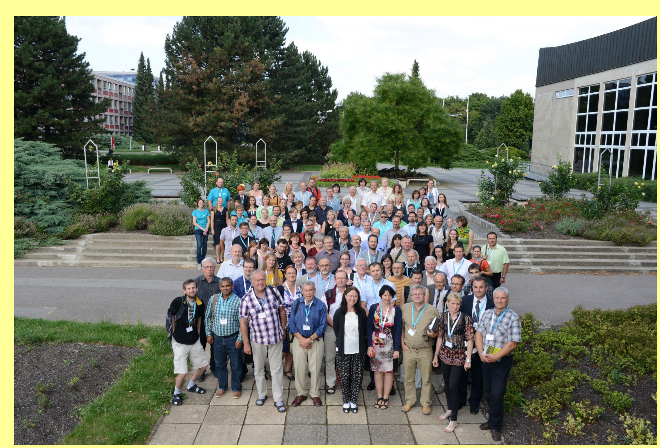
Participants of XX<sup>th</sup> Czech and Slovak Conference of Plant Protection, 1-3 September 2015, Prague

CSPP associates people interested in plant pathology to share and disseminate knowledge within this field. The main aim are publication activities, professional presentations, and conferences. CSPP organizes seminars and workshops focused on up to date problems of Plant Pathology.